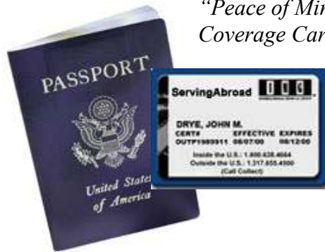
"Peace of Mind" Coverage Card